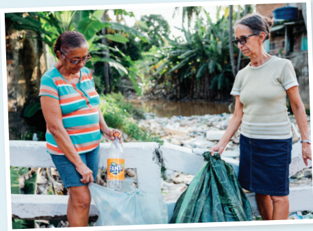
📷 The Clean River, Health City project involves the community in Coqueiral, Recife, Brazil, in tackling plastic pollution.