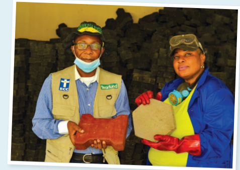
📷 Creating paving slabs from recycled plastic in a Tearfund-supported project in Kinshasa, DRC.

What would you like to give thanks for today?