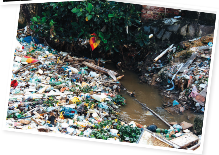
📍 Above: Mountains of waste in Dar es Salaam, Tanzania.