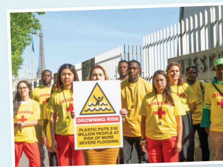
📷 Campaigners and waste pickers dressed as lifeguards at negotiations in Paris to issue a safety notice to governments about the flooding risks presented by plastic pollution.