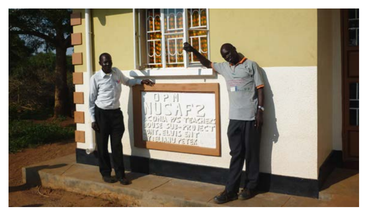
In Kanyangan, new teachers' houses, such as this one, were provided by the district as a result of CCM advocacy. The advocacy work also led to the clearing of a road, building a classroom, providing latrines to two schools, supplying a rainwater harvesting tank and providing desks and books to students.

This sense of equal relationship has led to good responsiveness from government and also better transparency. By contrast, in non-CCM communities, this relationship does not exist: for instance, in Otomei (control), people said, 'We have some good relationships in the community, but little with government leaders: we don't know them.' Four interviewees in the control community said that government hold the power because they go by their own plans. Those who had completed the training had more leverage to ensure greater accountability and relevance in government programmes. The chairman of Owii Advocacy Committee said: 'The power helps government to do appropriate service, so the community can reject what is imposed on them.'