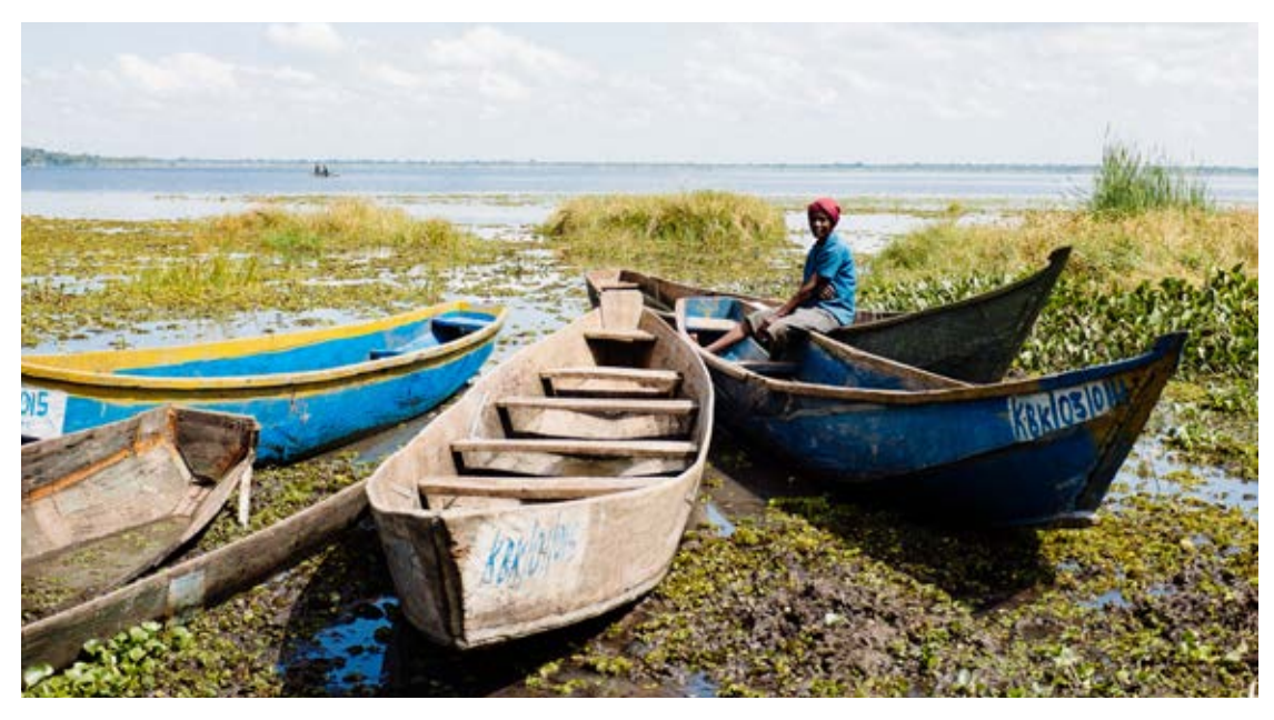
Before CCM advocacy training, the Owii community had to face a long journey across the lake to access the health centre. Successful advocacy resulted in mobile medical teams visiting Owii.

Overall, this research demonstrates that the church often provides an effective space to strengthen local governance and accountability to local communities through bridging the gap between communities and government. The research clearly shows how the CCM advocacy pilot programme in Uganda has effectively engaged individuals, churches and communities in local-level advocacy. This has led to some important improvements in ensuring transparency and participation, and in improving state responsiveness. As regards the five parameters focused on during this research, there was a significant increase in citizen engagement and government responsiveness, and key changes in power dynamics in communities which had gone through the full CCM advocacy process. Although transparency was somewhat increased in communities which had completed the full CCM advocacy training, government information was generally still not hugely accessible and the church was not always working to improve this situation. The training was generally inclusive in theory; however, more could be done to ensure that all people, particularly the most marginalised, are involved and have their voices heard. Overall, this research demonstrates that the church often provides an effective space to strengthen local governance and accountability to local communities.