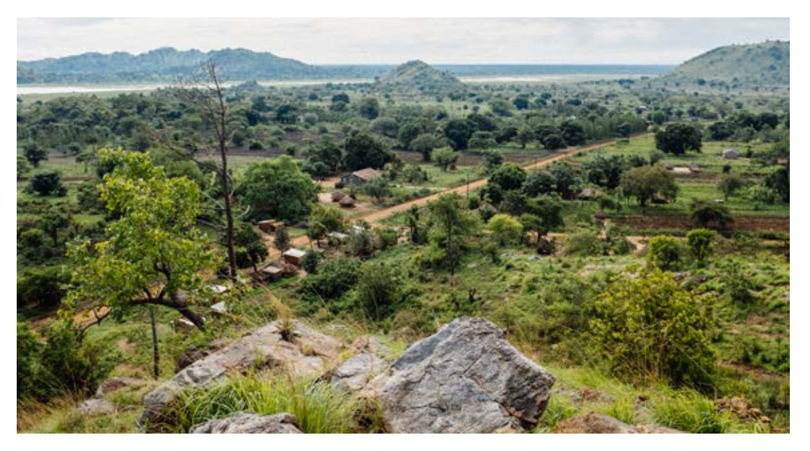
The view from near Bugondo Health Centre III towards Owii.

Uganda is a landlocked country in East Africa. The Teso region in the east of Uganda, the focus of this study, has the greatest number of people in poverty in the country, with 30 to 40 per cent living on less than US$1 a day. The region has suffered from civic strife, cattle raids and insurgency. Changing climate patterns, such as increased droughts, floods and variable precipitation cycles, are having a serious impact upon water and other natural resources, agricultural production and rural livelihoods. Uganda has been pursuing a decentralisation programme since the late-1980s, with the transfer of powers, functions and services from central government to local councils to restore democracy and return power to the people.