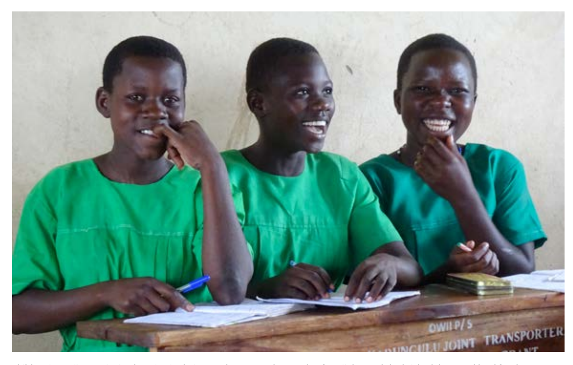
Children in Owii are enjoying learning in their new classroom. The people of Owii donated the bricks, labour and land for the classrooms, and the government provided the roof, the teachers and the teachers' housing and salaries.

This confidence and resulting independence allowed for increased citizen engagement, as people in the community worked together. The success of developing programmes for themselves seemed to create a virtuous cycle of increased confidence. This in turn caused more equal power relations with government, and encouraged greater government responsiveness.