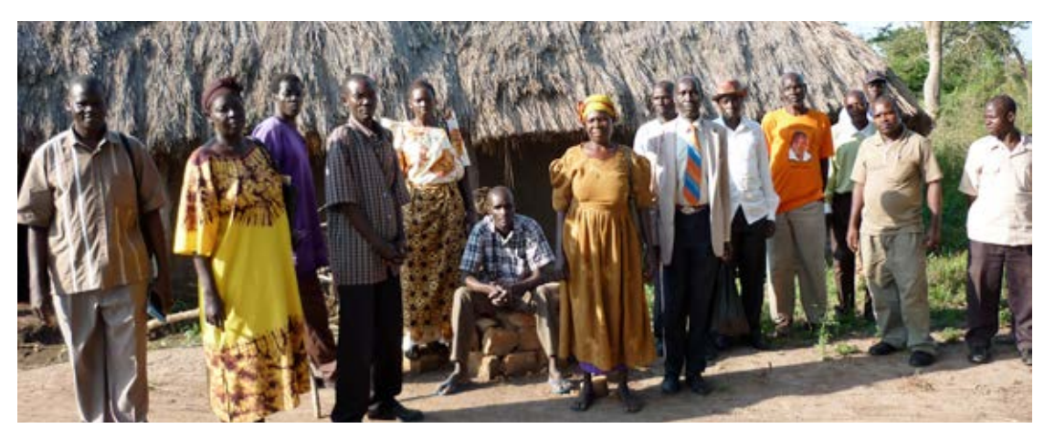
Mobile medical teams began visiting this building in Okulonyo after the community advocated to the local government.

The advocacy process follows the CCM process through identifying issues and stakeholders, selecting an Advocacy Committee, convening dialogue meetings with decision-makers, creating an advocacy plan, and then holding community review meetings (see Annex 3).