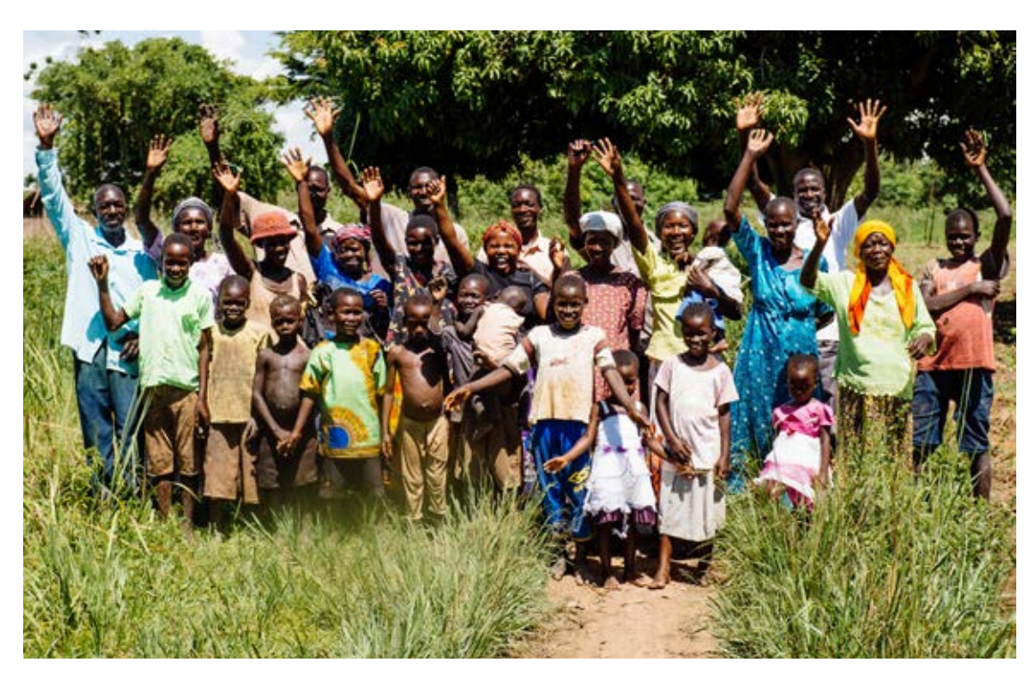
Community members from Owii, Uganda, have benefited from CCM advocacy.