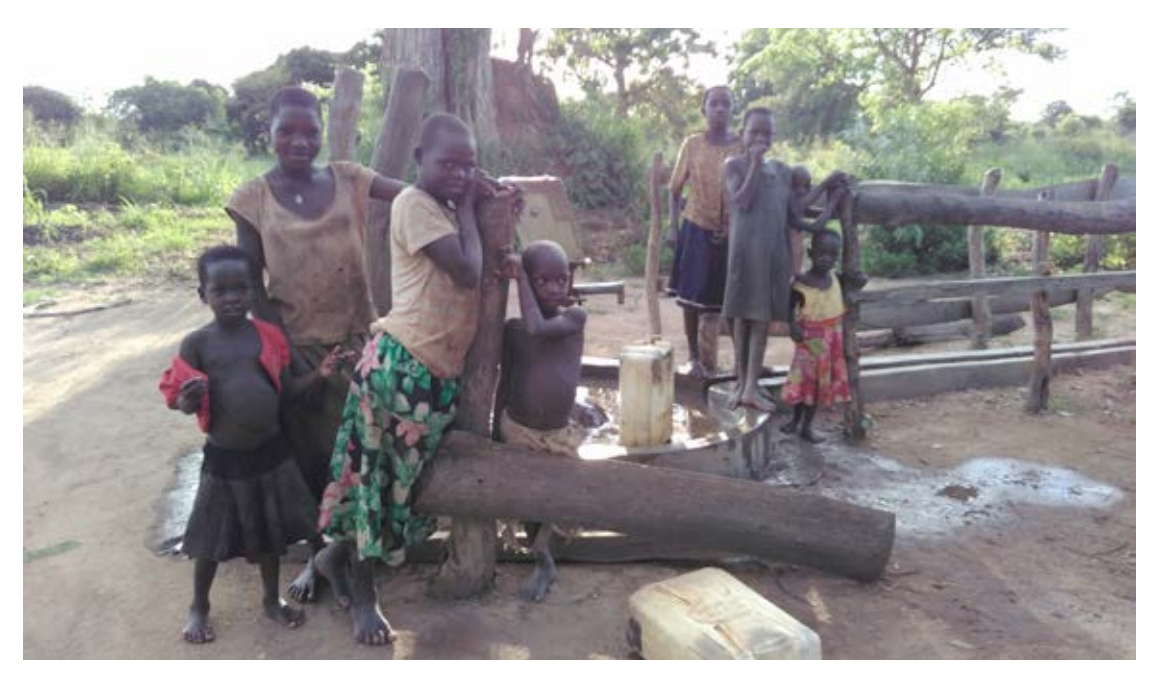
In 2014 the Okulonyo community were provided with a borehole, just months after petitioning the government for this.

Generally, if the request was for a borehole, it was most likely to have a response as this is a key priority of the government. Those in Serere who had completed the training had the quickest responses to their petitions (see Table 3). The table is based on FGDs and in some communities there was uncertainty about when petitions had been made and when there had been responses from government. It was also difficult to decipher which petitions were through the normal planning cycle and which were as a result of the advocacy training. However, the general picture suggests that the training has led to quicker and more frequent responses by government, particularly in Akoboi, Okulonyo and Owii.